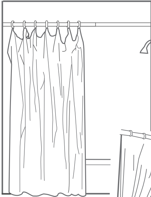
Standard Shower Curtain